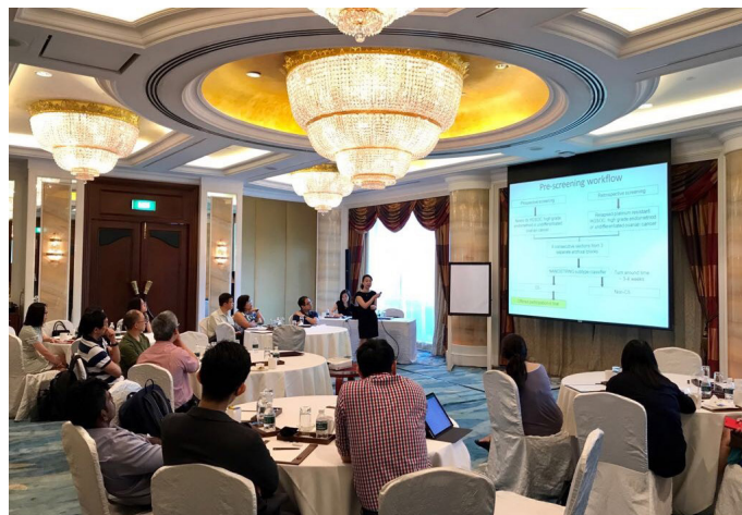
Fig 2: Inaugural Meeting of the Gynecologic Cancer Group Singapore (GCGS) on 19th Aug 2017

The current executive board members of GCGS are: