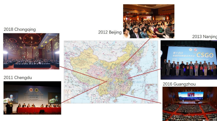
Figure 2. Recent meetings of CSGO

Ovarian Cancer Program, Division of Gynecologic Oncology, Department of Obstetrics and Gynecology, Zhongshan Hospital, Fudan University, Shanghai, China