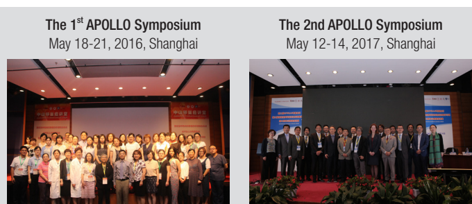
Figure 1. The first surgical training program on ovarian cancer in China.

Treatment of ovarian cancer is still a challenged task in China. As a council member of ASGO, I will focus on education and training of surgical skills, clinical practice, best understanding of radical surgery for ovarian cancer in young generation; communication and collaboration with other Asian countries. The symposium of Asian-Pacific Ovarian Cancer Laparotomy and Laparoscopic Operation (APOLLO) is a platform for Asian doctors specialized in ovarian cancer research. It was initiated on May of 2016 in Shanghai, and doctors from China, Korea and Japan were involved the activities (Figure 1).