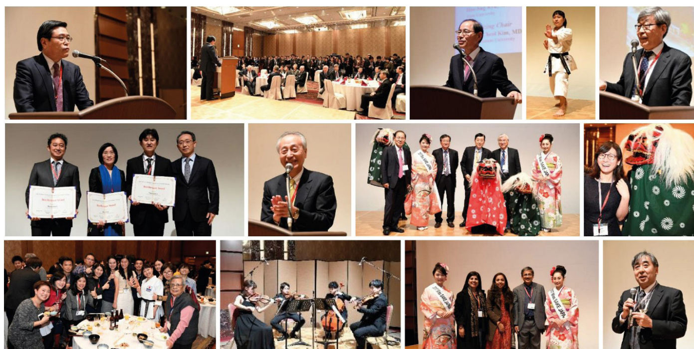
Figure 1. Scenes of a banquet welcoming the participants (December 1, 2017, Royal Park Hotel, Tokyo)

Congress President of ASGO 5th Biennial Meeting Professor, Department of Obstetrics and Gynecology Keio University School of Medicine